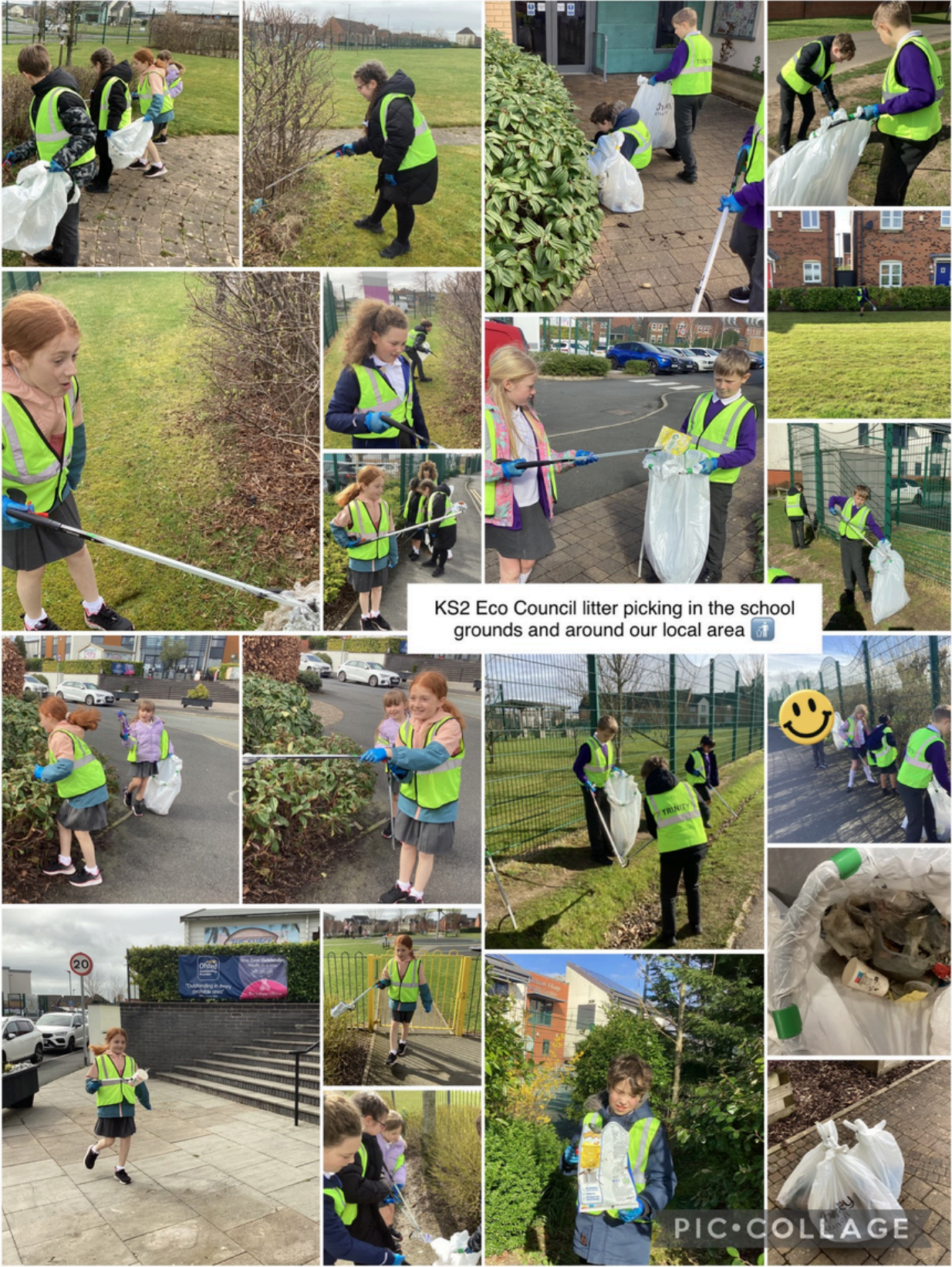
KS2 Eco Council litter picking in the school grounds and around our local area 🗑️