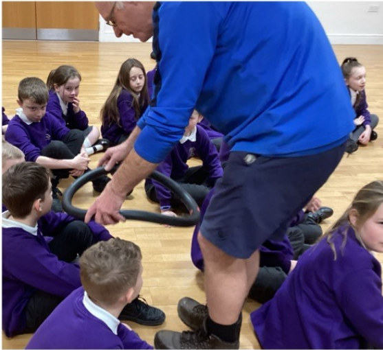
5W learnt how to fix a puncture during Bike Fix in preparation for their upcoming Bikeability sessions